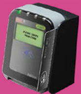
iUC 280/iUC 285